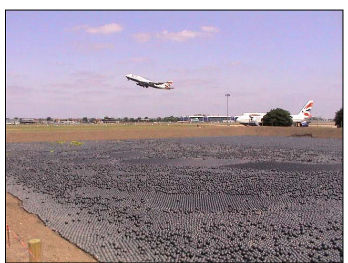
Water retention ponds can be proofed against Birds with netting or, as in this case with floating 'bird balls'

airport, removal of trees and bushes, netting of water bodies, excluding birds from buildings by netting or other means, selection of non-attractive amenity planting around terminals etc.. Whatever techniques are used, all airports should be able to show that they have assessed the bird attractions on their property and developed and implemented a habitat management plan to reduce these attractions as far as is practicable.