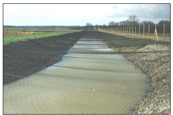
Cleared and netted drainage channels offer no bird attration whilst maximising their drainage functions

Once the attraction has been identified, a management plan should be developed either to remove it entirely, reduce it in quantity, or to deny access to it. Because airfields around the world are all different and because the bird/wildlife species that frequent them vary from region to region, it is not possible to define precisely what types of habitat management will effective at a particular site.