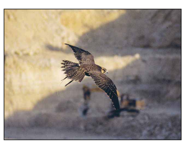
Falcons represent a real threat to birds and will not be ignored. Their use close to aircraft requires great care, skill and considerable expense

Trained falcons and dogs, which are both potential predators for many species of hazardous birds found on airports, are undobtedly effective in dispersing birds. To work properly, however, considerable investment in the training of both the animals and their handlers needs to be made. This training is essential both to ensure that the animals themselves do not become a strike risk and also to ensure that the deterrent value of deploying the falcon or dog is maximised. Airports should not underestimate the staff time and cost involved in incorporating falcons or dogs in their bird control programmes.