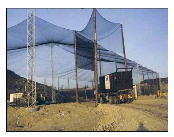
Landfills close to airports can be netted to exclude hazardous birds

Providing that best practice in terms of habitat management and active control are put in place on an airfield, the strike risk arising from the airfield itself can be largely controlled in all but the most extreme circumstances. Managing the strike risk that originates from off the airfield is a more complex and difficult challenge. Firstly, the problematic sites need to be identified by means of a hazard assessment. This can pose problems because, for some species, such as gulls, the sites frome which birds that cause a risk at the airport originate can be many miles from the airport itself. Having identified sites that support hazardous birds/wildlife it is then necessary to estimate the risk that they pose to the airport. Birds/wildlife on the airport itself can reasonably be assumed to pose some level of risk as their proximity to the aircraft means that they will eventually cross a runway ot taxiway and may thus be struck. Birds/wildlife at a site remote from the airport may pose no risk at all if they never cross the airfield or its approaches. The same basic principles apply when developing a management plan whether it is on or off the airfield. A risk assessment thus requires either a measurement or an estimation of how often birds/wildlife at an