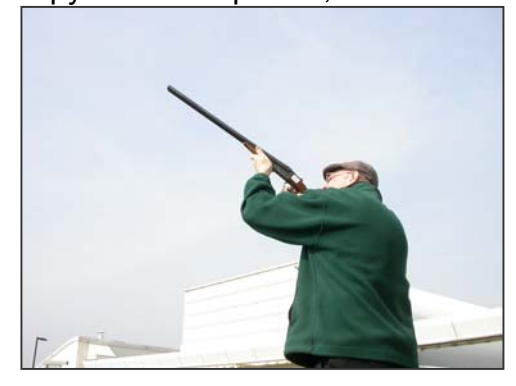
The limited use of lethal control is an important part of an effective bird management programme

mounted distress call generators produce an impression of a direct threat which can be continually varied in time and location by the operator in a manner not available to static systems. In all cases staff should have access to a shotgun to remove birds/wildlife that cannot be dispersed by non-lethal means, providing that the relevant bird protection and firearms legislation in the country concerned permits this. It is vital that staff are properly trained in the safe use of firearms and carry the necessary permits to own or operate the weapon. There is some debate as to the necessity of the use of lethal control in aerodrome bird/wildlife management, but the view